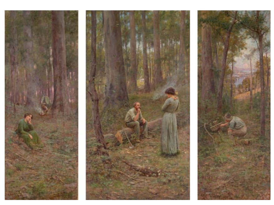
Source: https://en.wikipedia.org/wiki/Frederick_McCubbin#/media/File:Frederick_McCubbin - The pioneer - Google_Art_Project.jpg