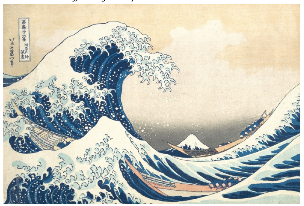
The Great Wave off Kanagawa by Katsushika Hokusai